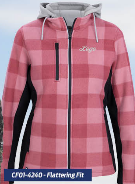
CF01-4240 - Flattering Fit