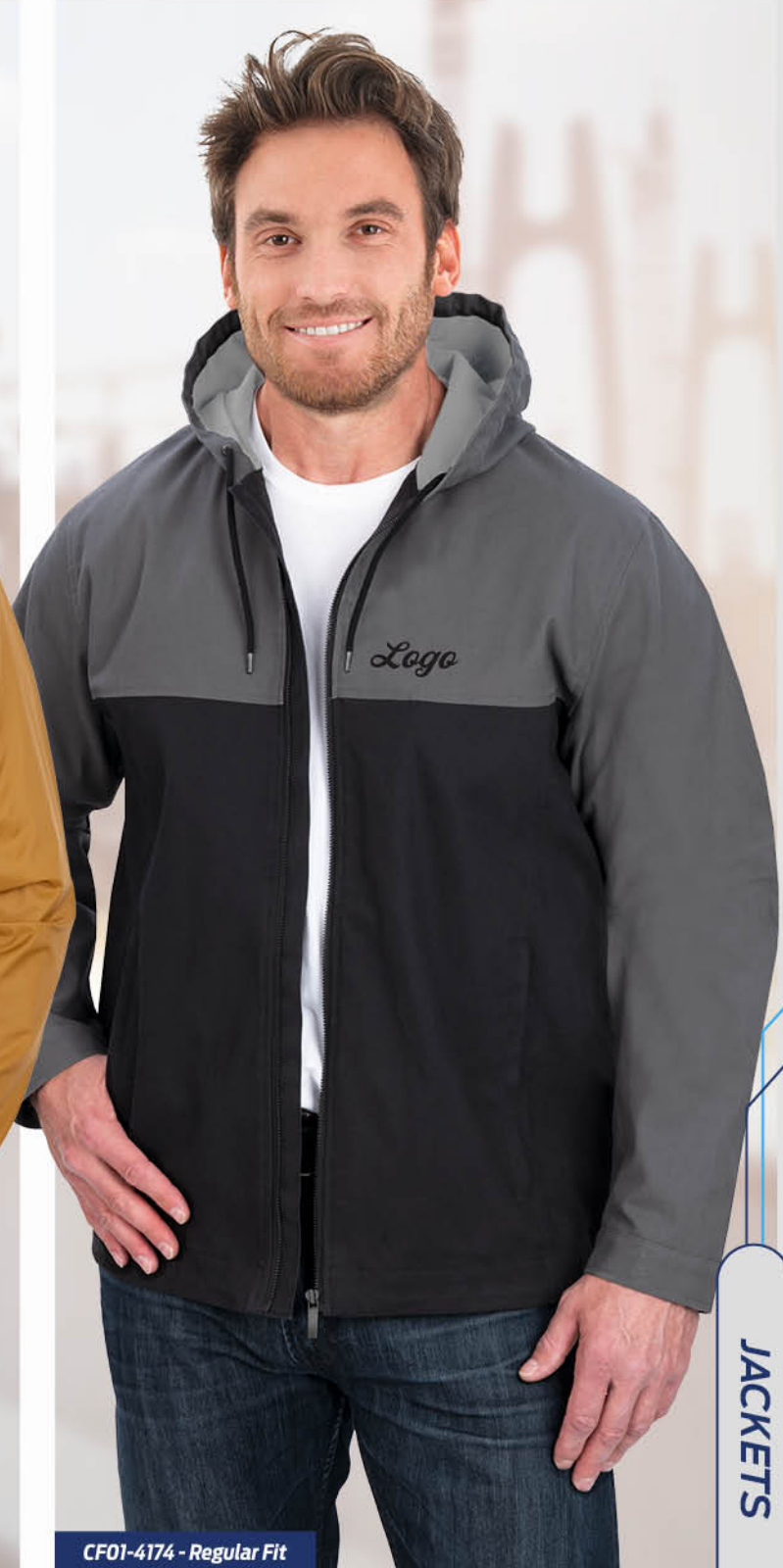
CF01-4174 - Regular Fit