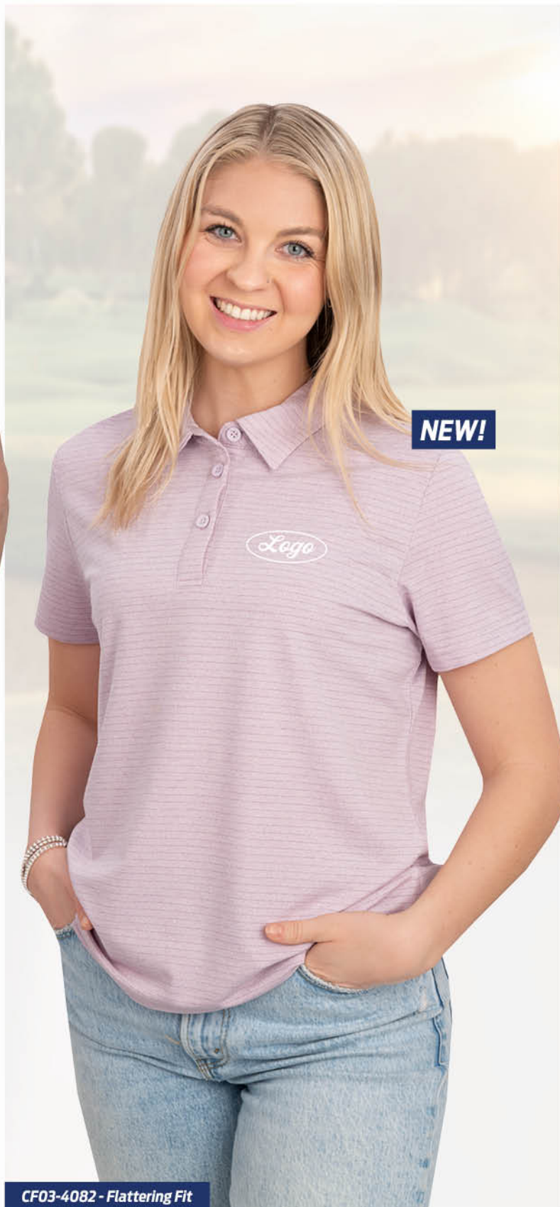
CF03-4082 - Flattering Fit