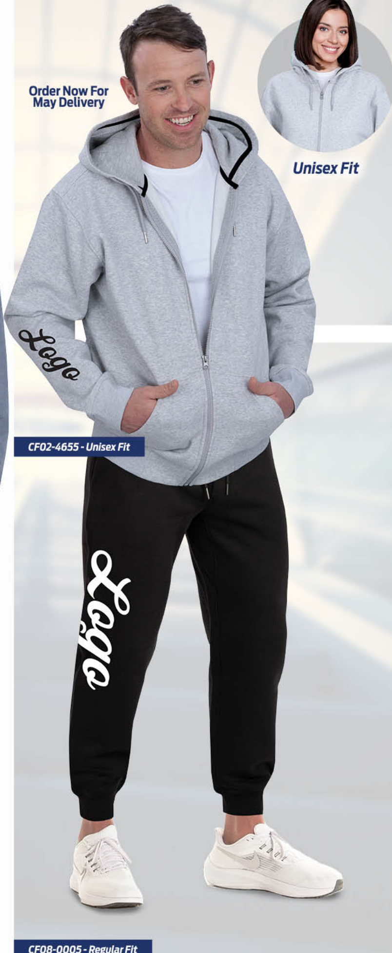
CF02-4655 - Unisex Fit