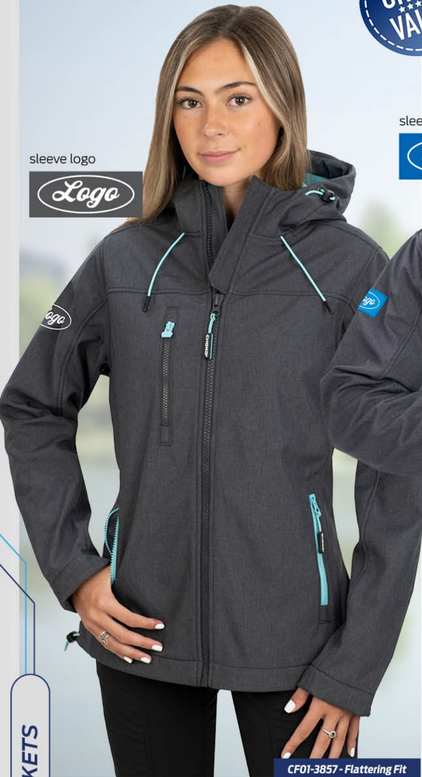
CF01-3857 - Flattering Fit