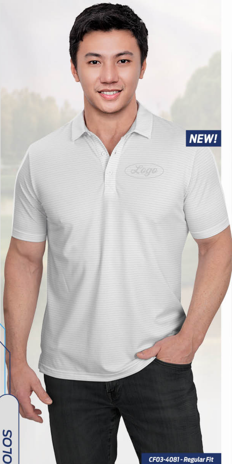
CF03-4081 - Regular Fit