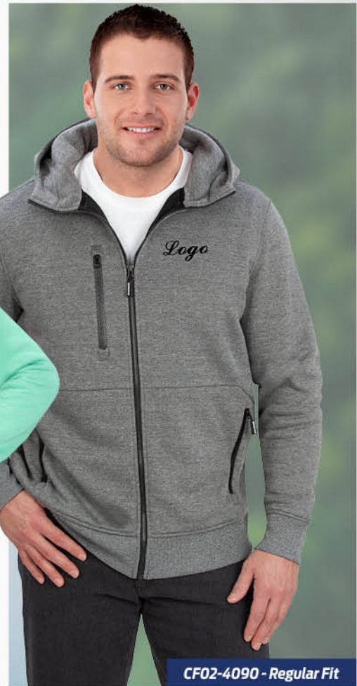
CF02-4090 - Regular Fit