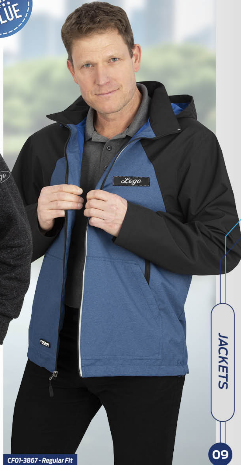
CF01-3867 - Regular Fit