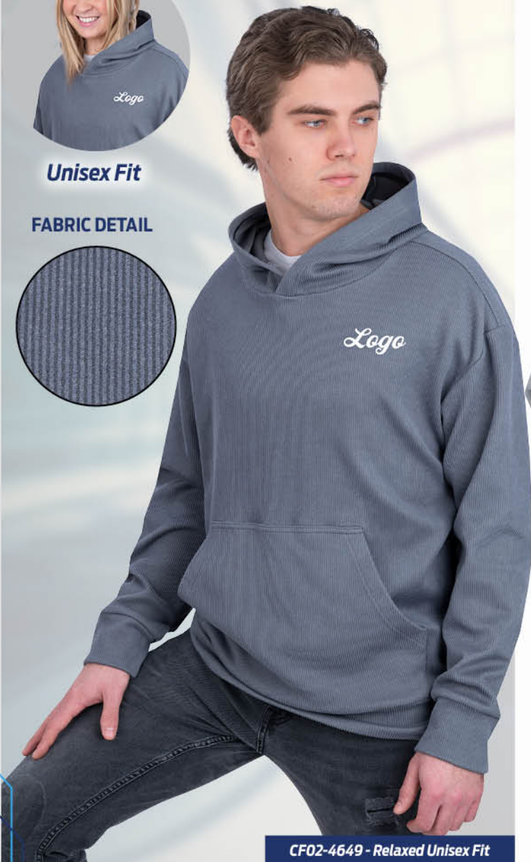
CF02-4649 - Relaxed Unisex Fit