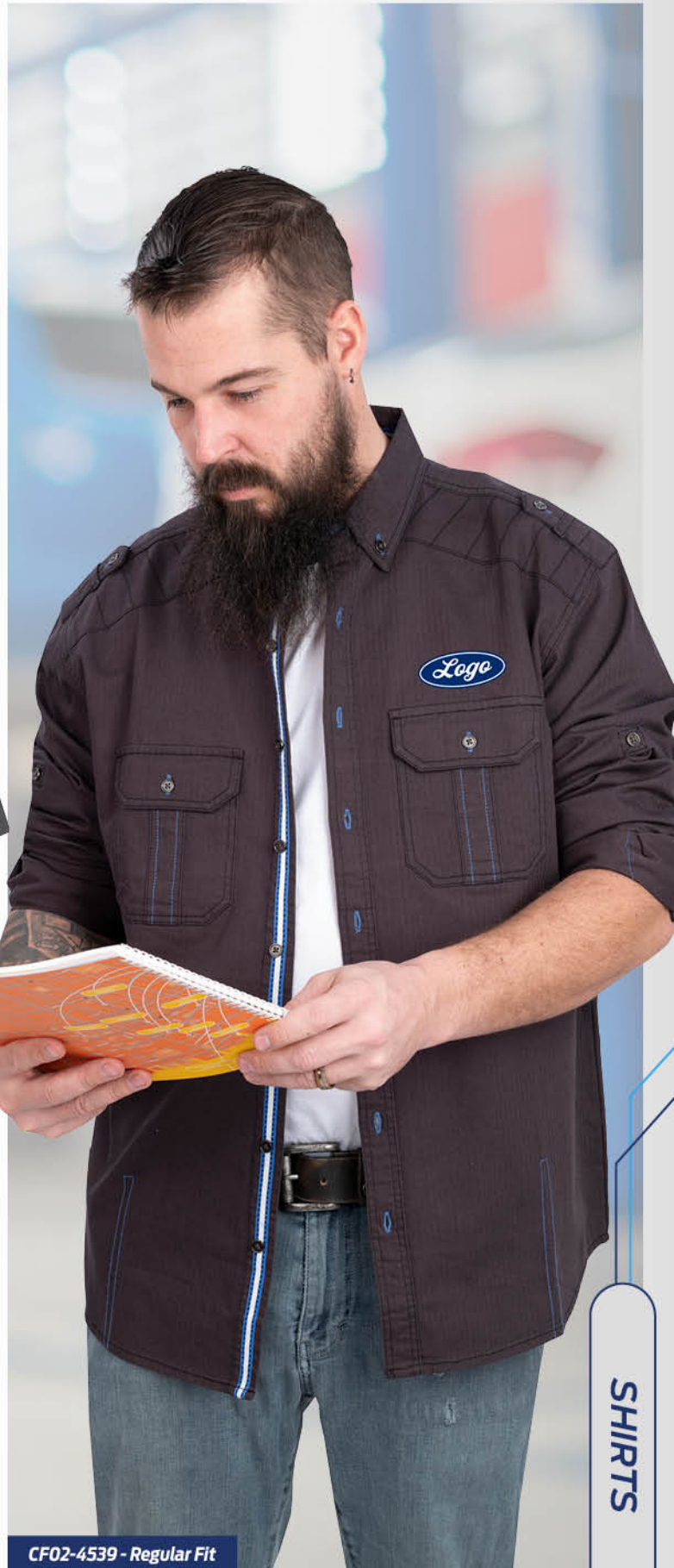
CF02-4539 - Regular Fit