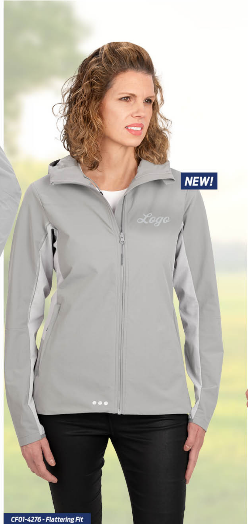
CF01-4276 - Flattering Fit