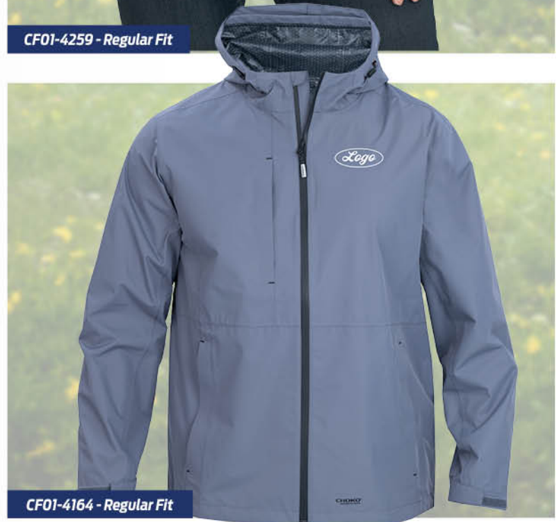
CF01-4164 - Regular Fit