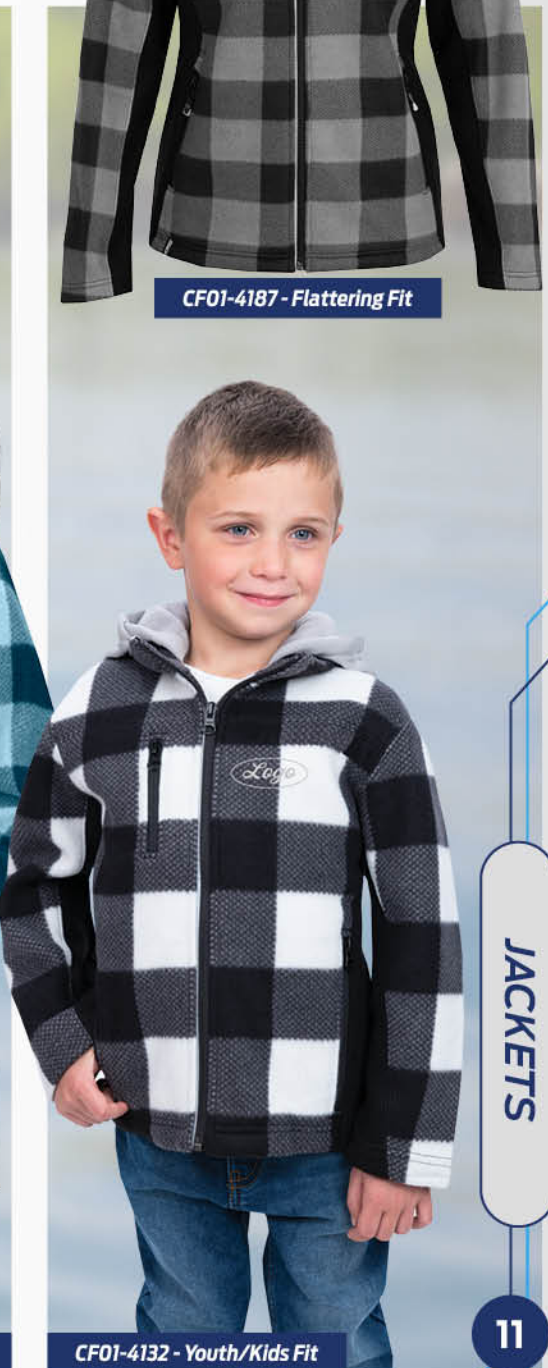
CF01-4132 - Youth/Kids Fit