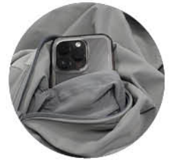
Hidden cell phone pocket