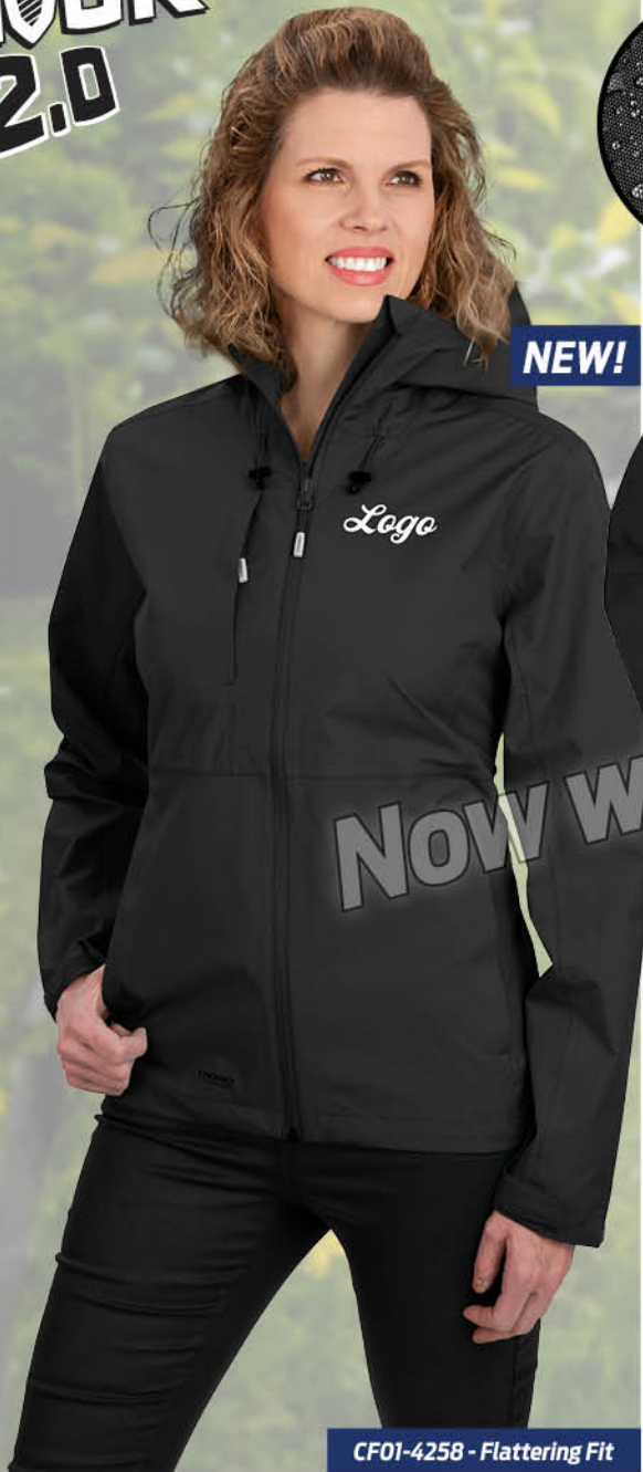
CF01-4258 - Flattering Fit