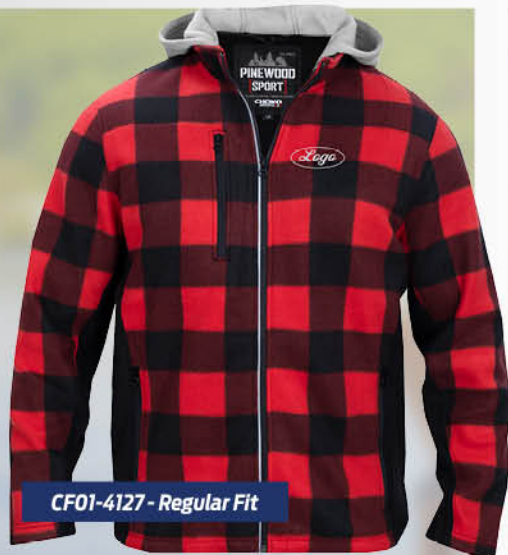
CF01-4127 - Regular Fit