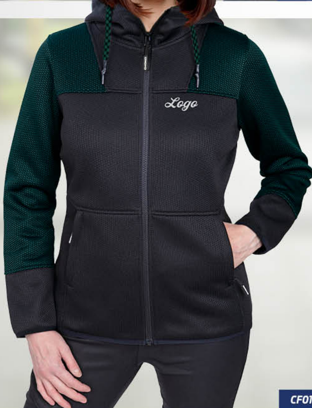
CF01-4146 - Flattering Fit