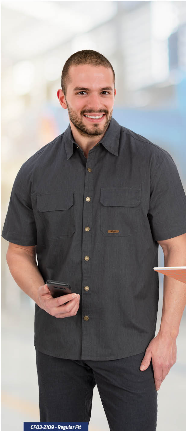
CF03-2109 - Regular Fit