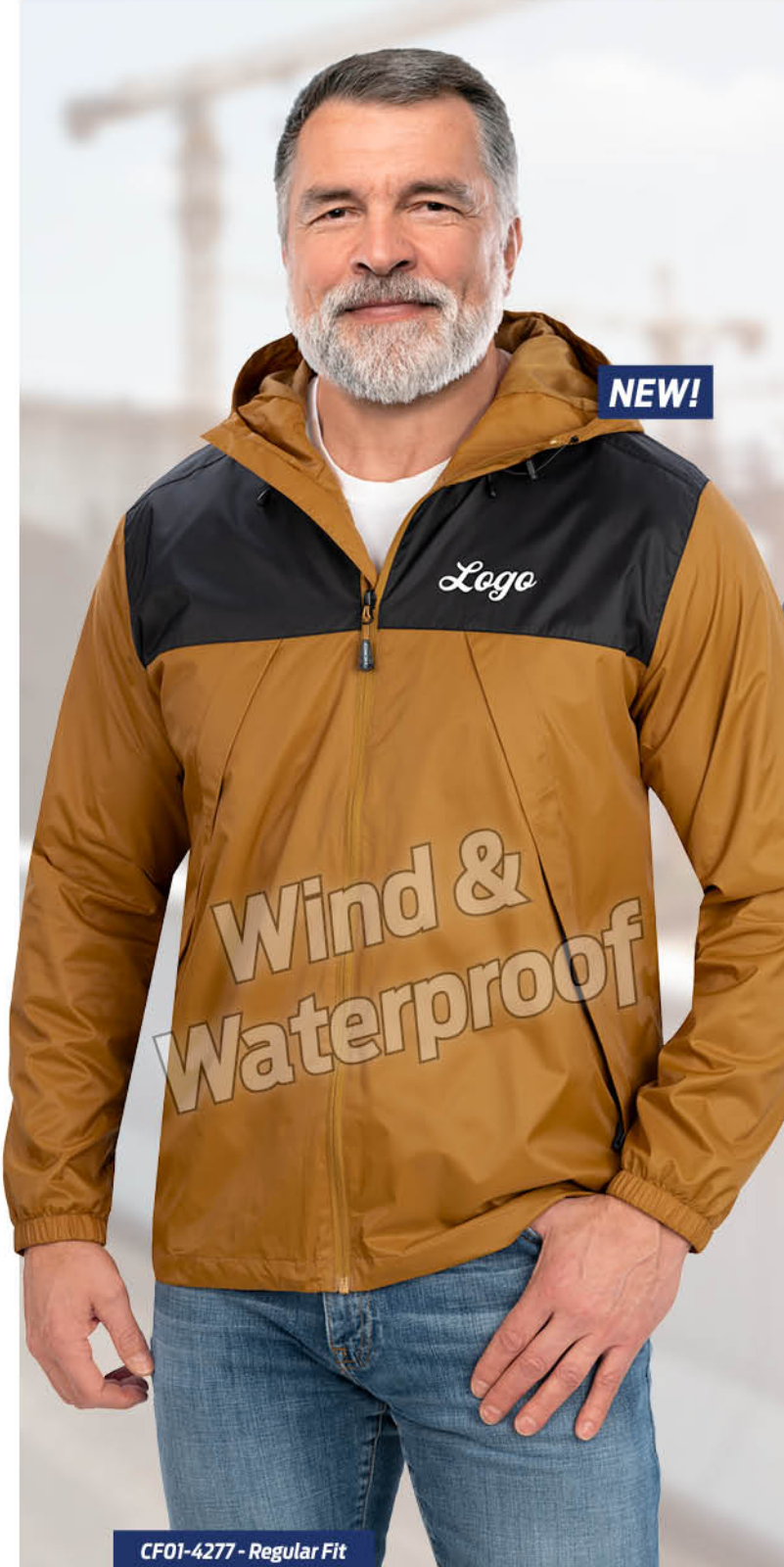
CF01-4277 - Regular Fit