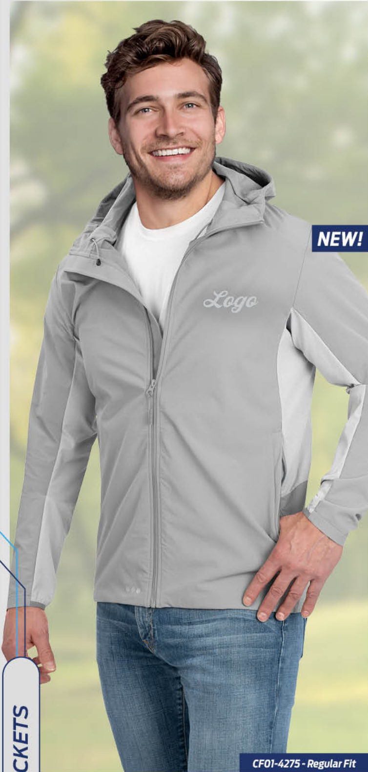
CF01-4275 - Regular Fit