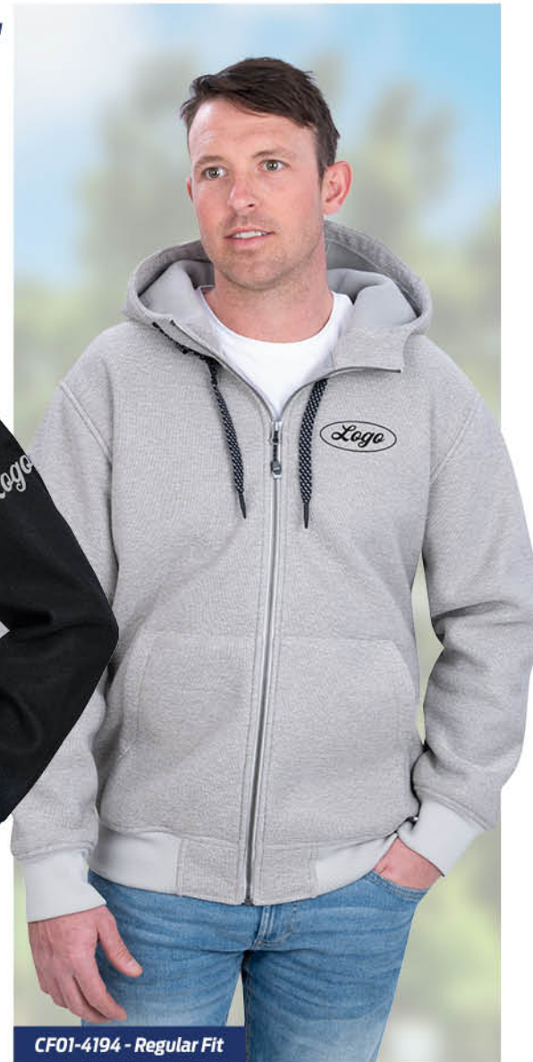
CF01-4194 - Regular Fit