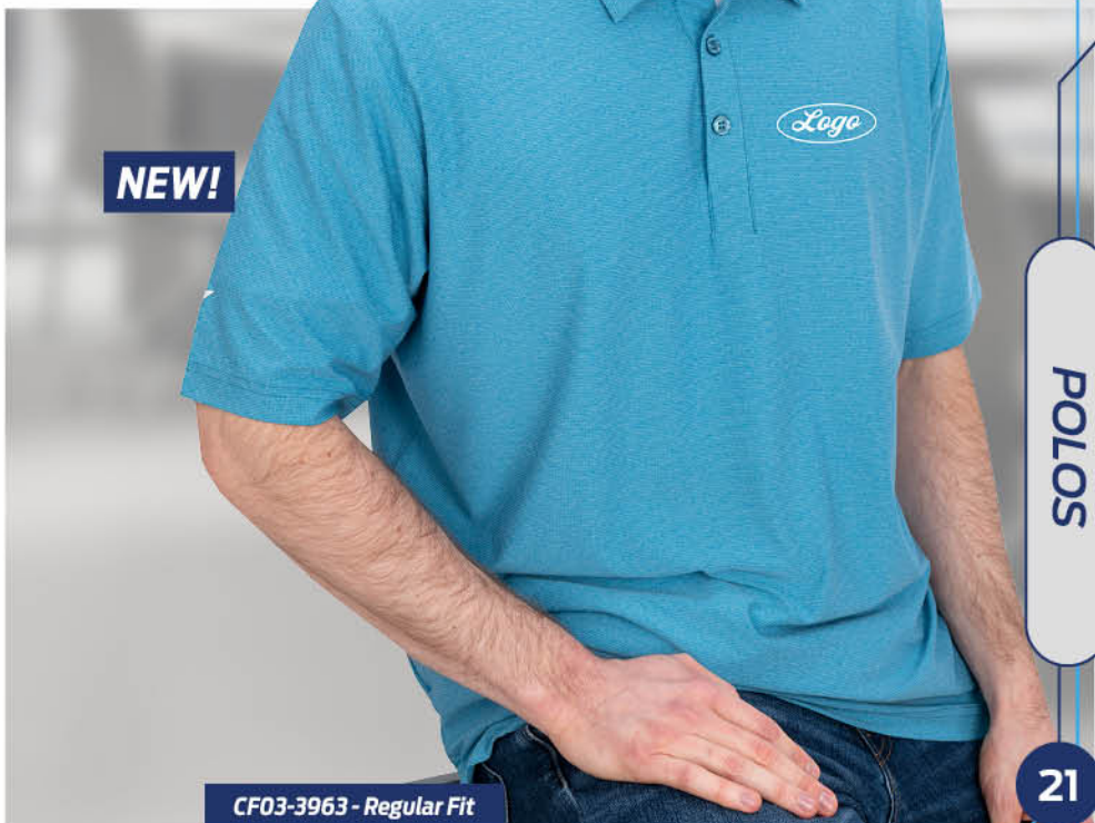
CF03-3963 - Regular Fit