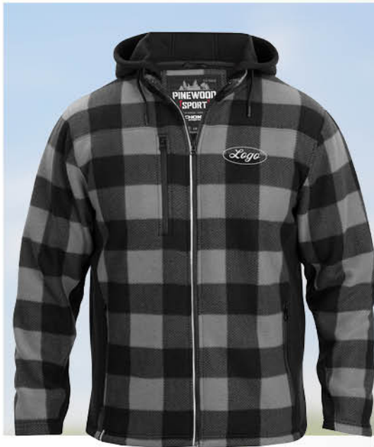
CF01-4139 - Regular Fit

XS (4-5), S (6-7), M (8-10) | Youth/Kids Fit