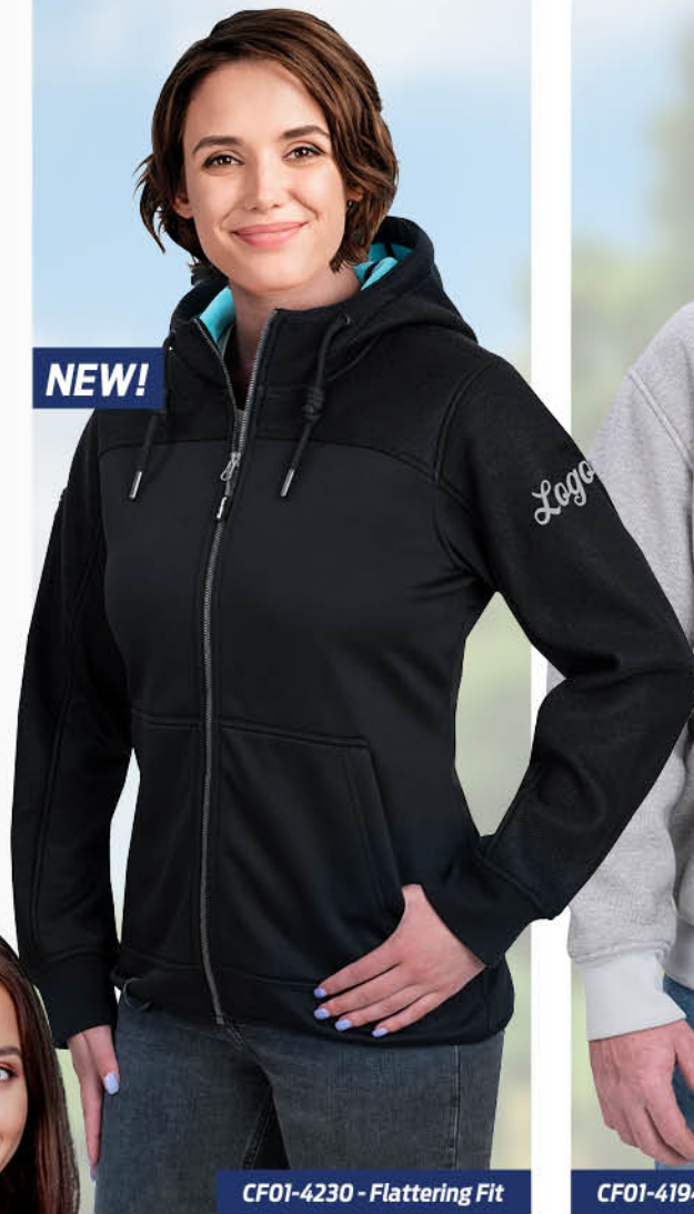
CF01-4230 - Flattering Fit