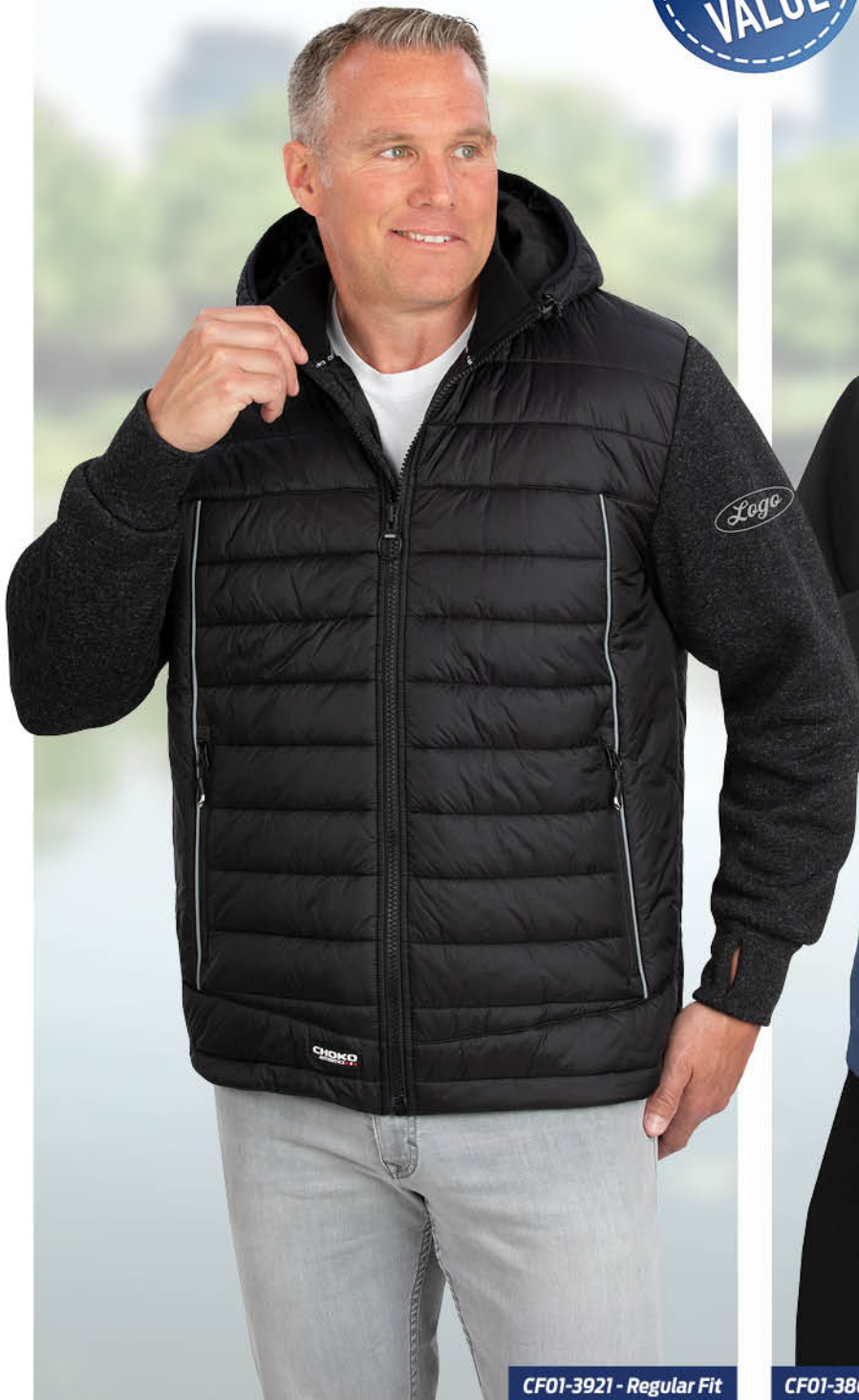
CF01-3921 - Regular Fit