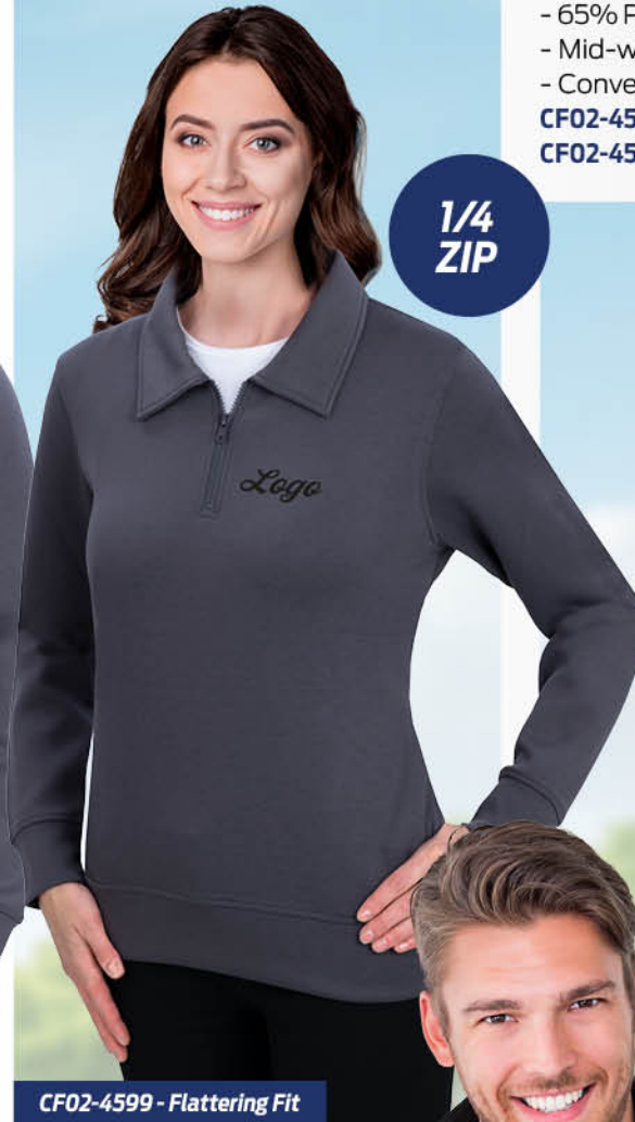
CF02-4599 - Flattering Fit