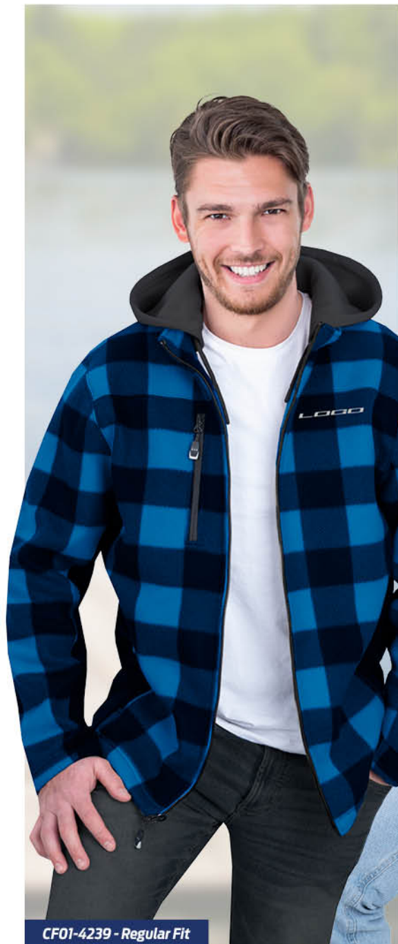
CF01-4239 - Regular Fit