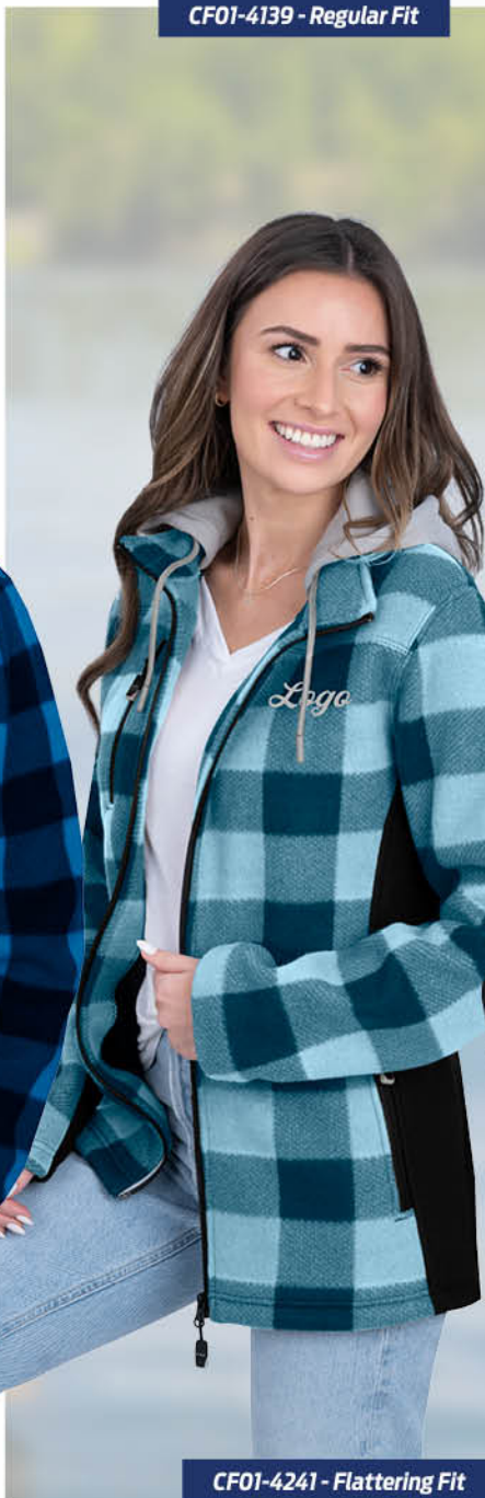
CF01-4241 - Flattering Fit