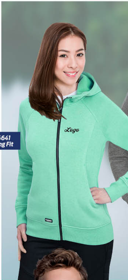
CF02-4641 Flattering Fit