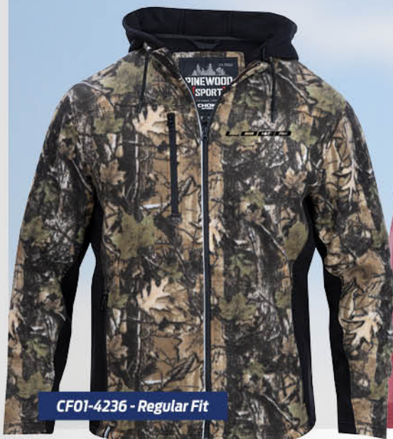
CF01-4236 - Regular Fit

CF01-4281 | Blackout/Tough Tan | S-3XL | Men's