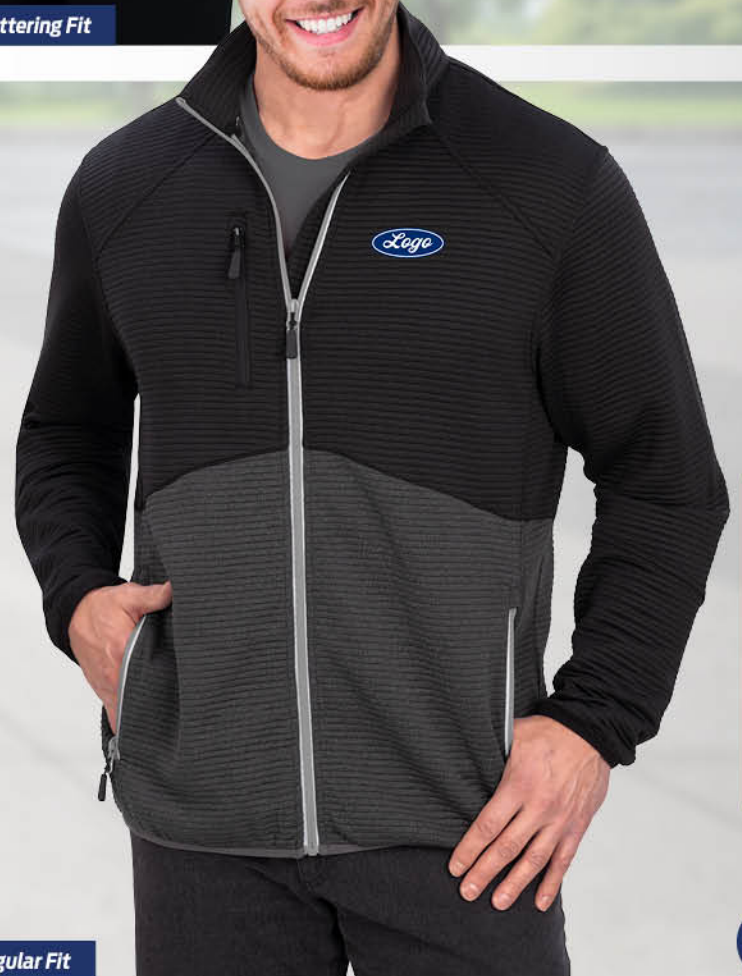
CF02-4546 - Regular Fit