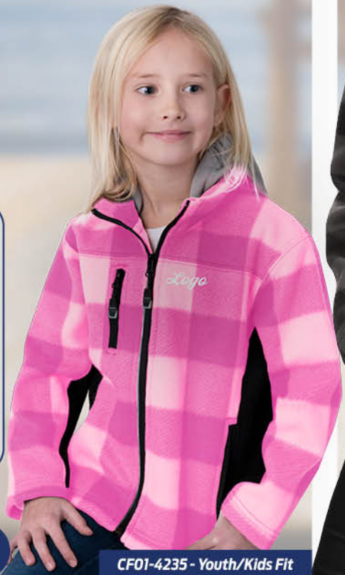
CF01-4235 - Youth/Kids Fit