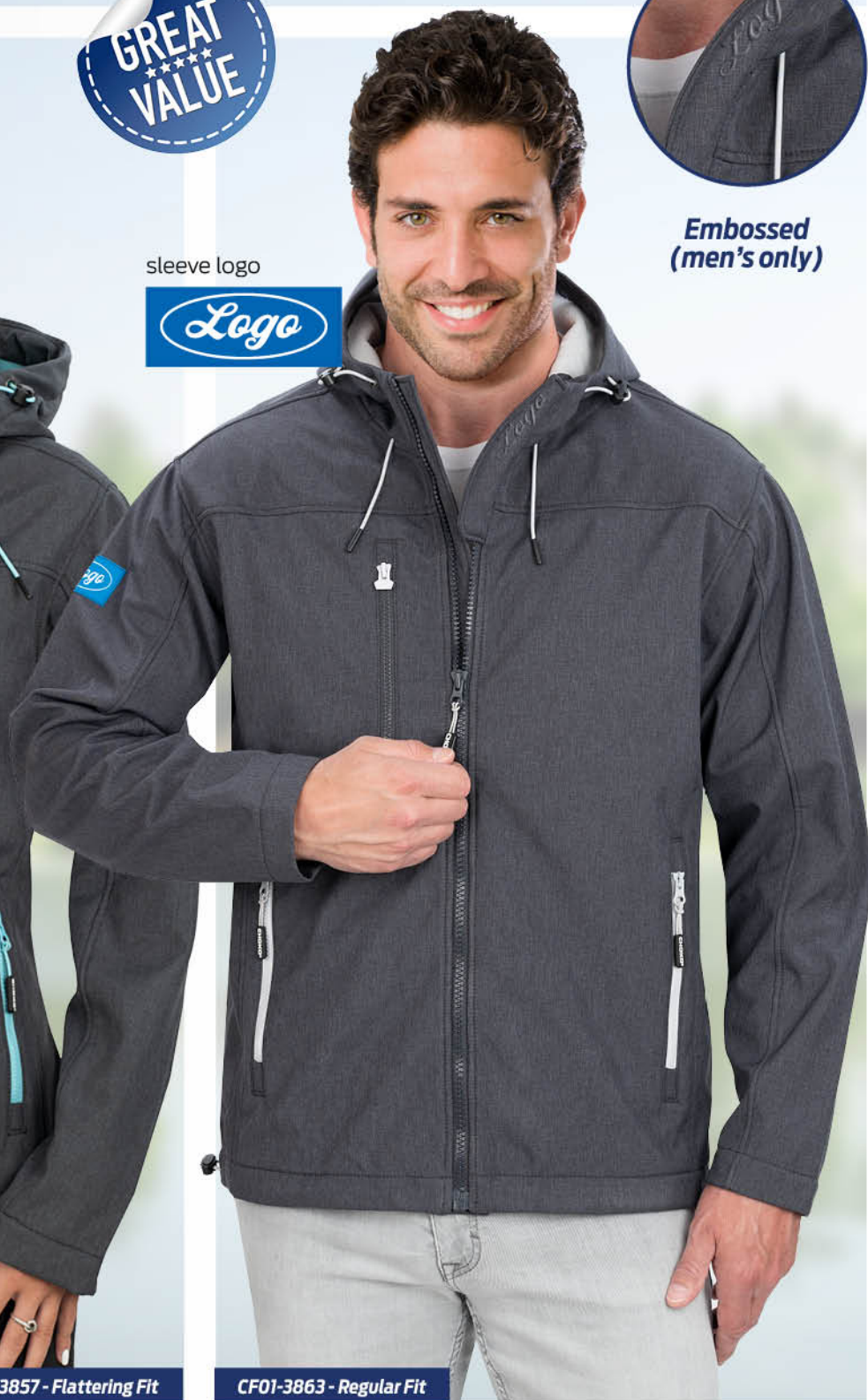
CF01-3863 - Regular Fit