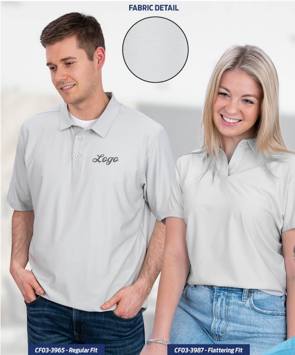
CF03-3965 - Regular Fit