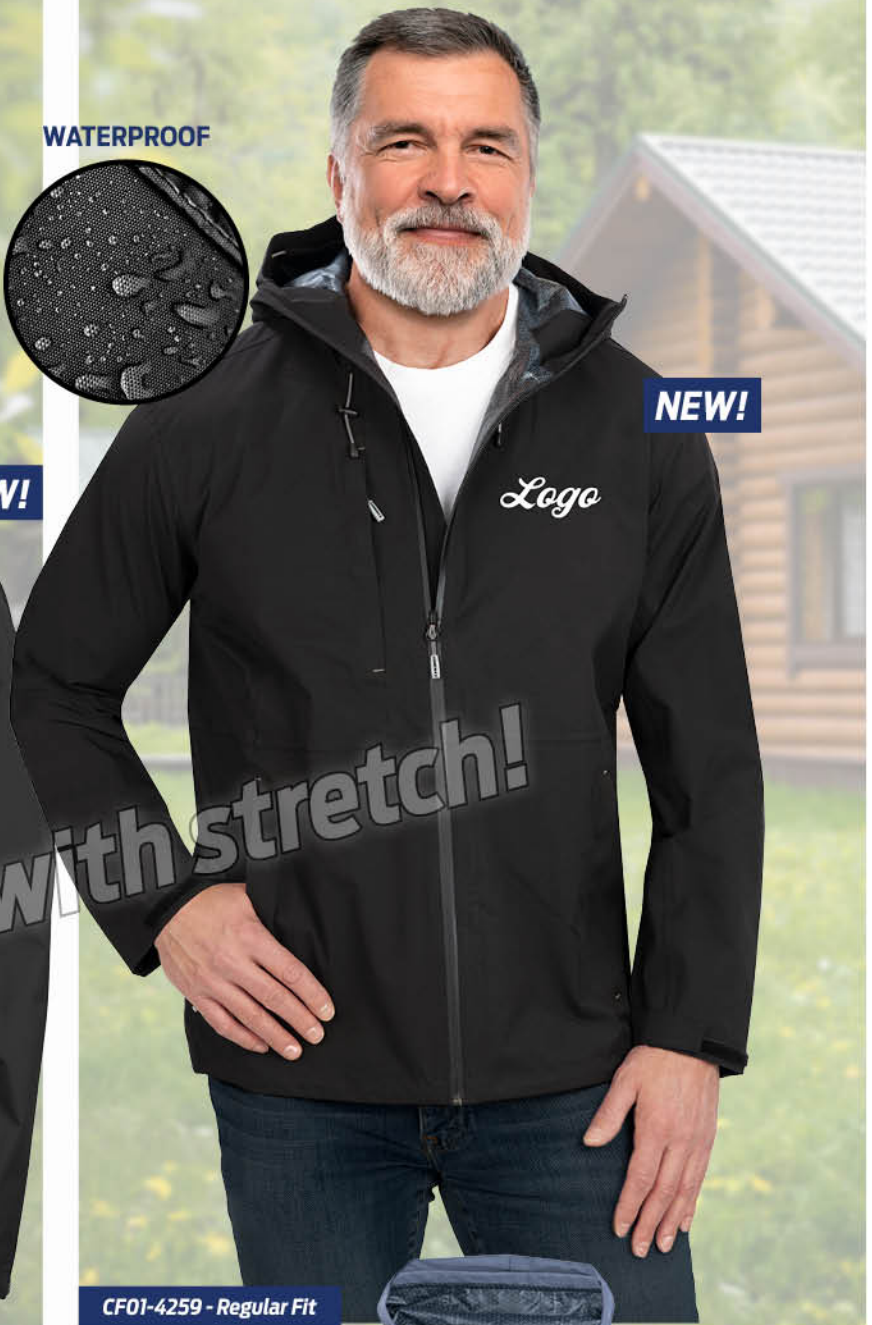
CF01-4259 - Regular Fit