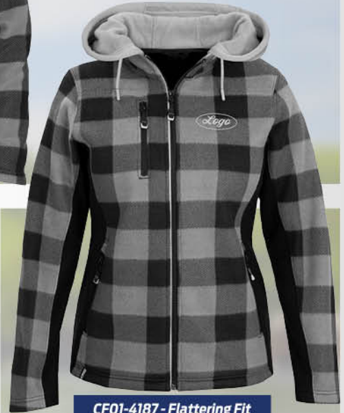
CF01-4187 - Flattering Fit