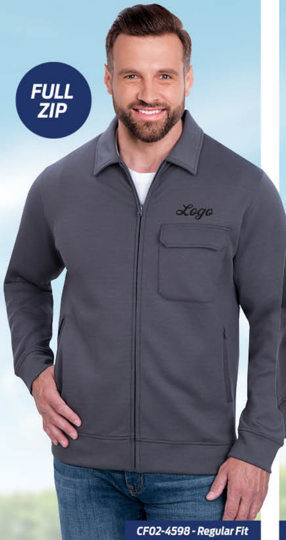
CF02-4598 - Regular Fit